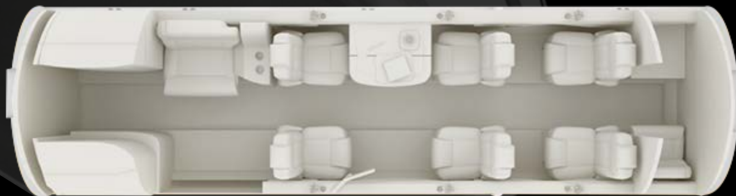
FLOOR PLAN DAY